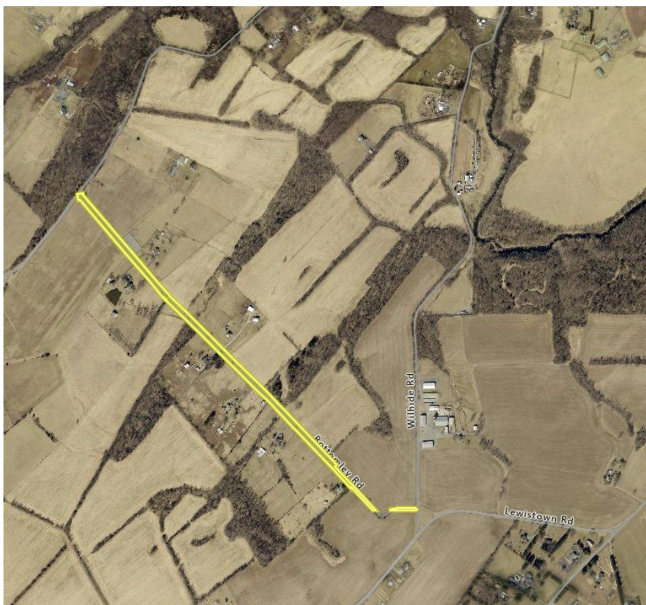
Image 1: Aerial of Bottomley Road

The public meeting for designation to the Frederick County Rustic Roads Program will be held at 6:00 p.m., or thereafter, on December 10, 2025.