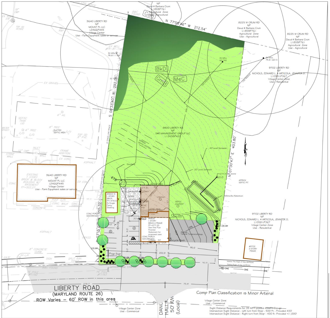
Exhibit #1 - Site Plan Rendering