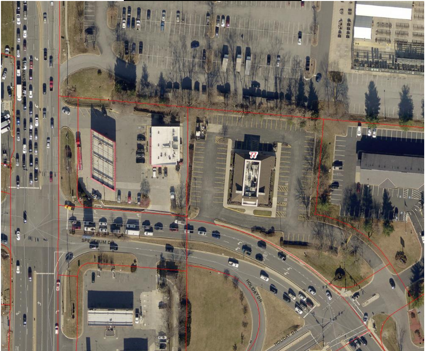
Figure 1: Site Vicinity Map – Aerial Image

The Site will retain existing three entrances; one on Route 85, one on Spectrum Drive, and the Bob Evans entrance off the common drive with the hotel and restaurants. The Bob Evans entrance on Spectrum Drive will be closed.