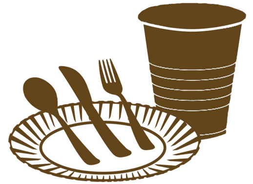
Disposable Cups, Plates & Cutlery