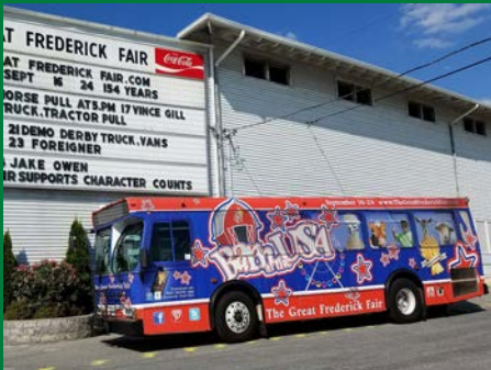
2016 Wrapped Fair Bus