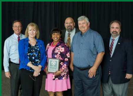
MDOT, MTA, TAM & Transit Staff at Annual TAM Awards 2016