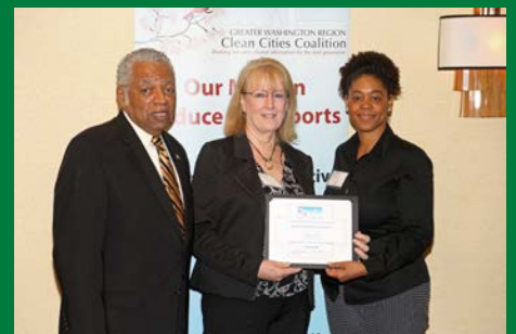
TransIT Director Accepts Award at Greater Washington Clean Cities Coalition Event