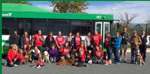
GoTeam Therapy Dogs Learn to Ride Transit Bus