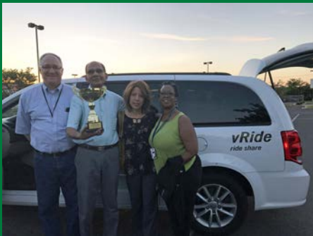
FY17 Frederick County Commuter of the Year - NIH Vanpool