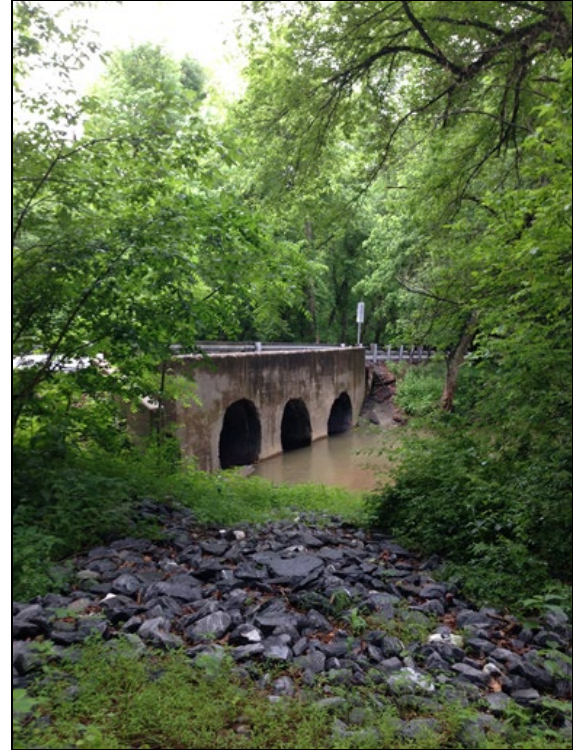
Existing Gas House Pike Bridge to be replaced

The bridge structures and roadway approaches will have two 11-foot lanes with 5-foot shoulders. This is a federal aid project and construction funding utilizes 80% Federal funds and 20% County funds.