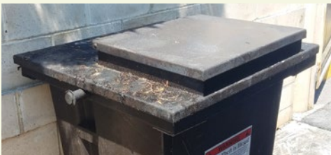
Covered Grease Bin