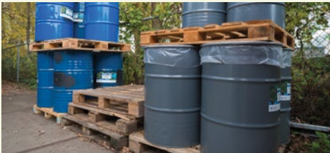
Using Secondary Containment