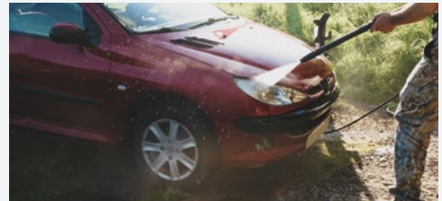
Washing Vehicles on Pavement