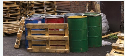
Not Using Secondary Containment