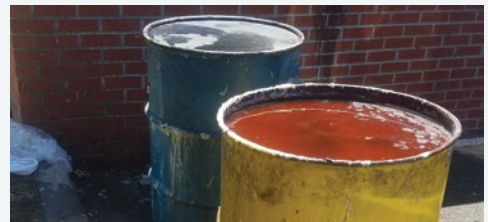
Uncovered Grease Bins