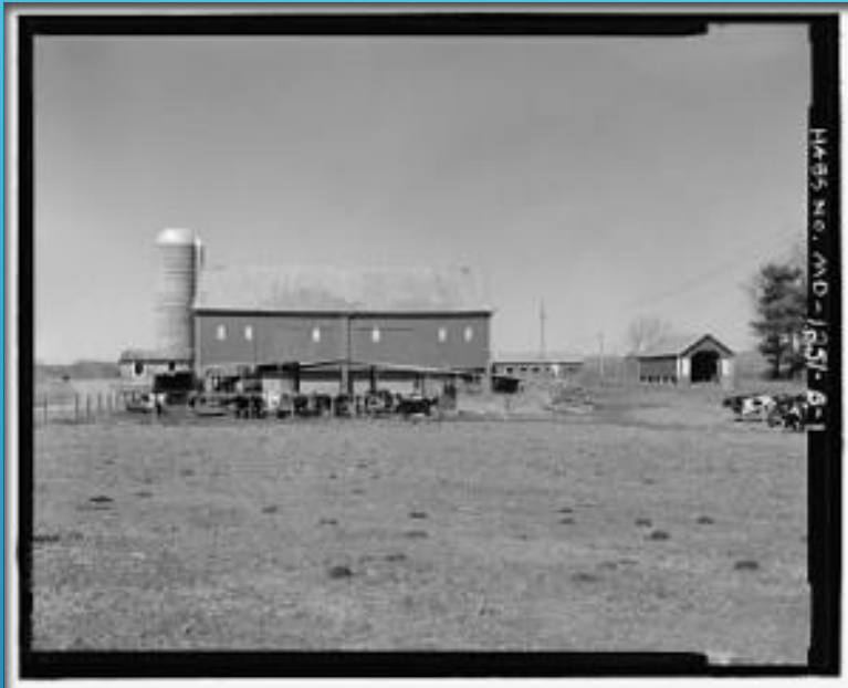
Front (southeast) side - Thomas Farm, Barn, 4632 Araby Church Road, Frederick, Frederick County, MD. Photograph, Historic American Building Survey, National Park Service, U.S. Department of the Interior, Compiled after 1933.

http://hdl.loc.gov/loc.pnp/hhh.md1784/photos.3632 31p accessed December 11, 2020).