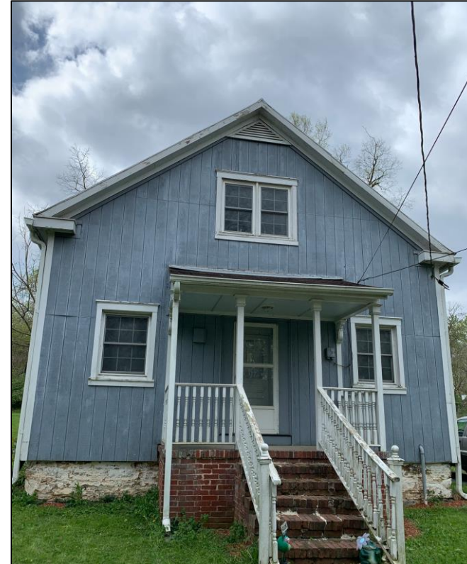
Buckeystown African American School, Designated to the County Register of Historic Places, November 1, 2022 (CR #22-05)