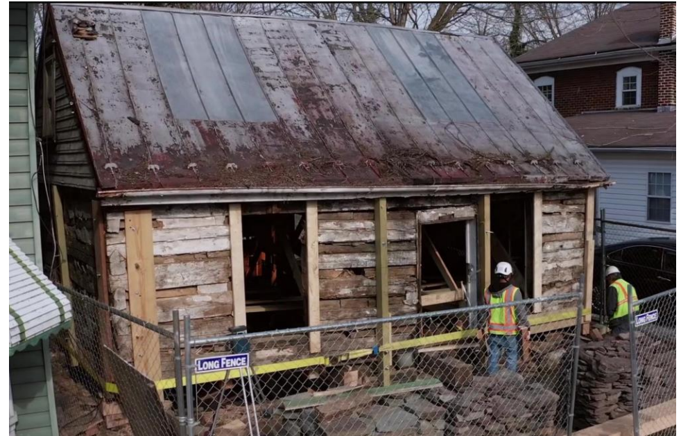
Jonathan Street cabin, Hagerstown, Maryland