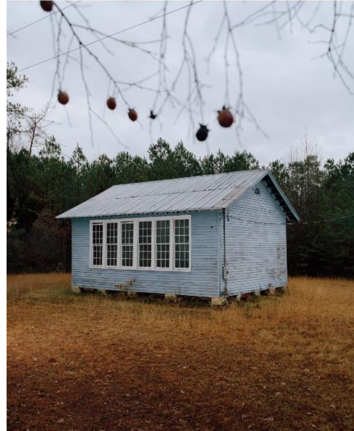
A Rosenwald school, location not specified. From "The Fight to Preserve African American History," The New Yorker , Jan. 27, 2020.